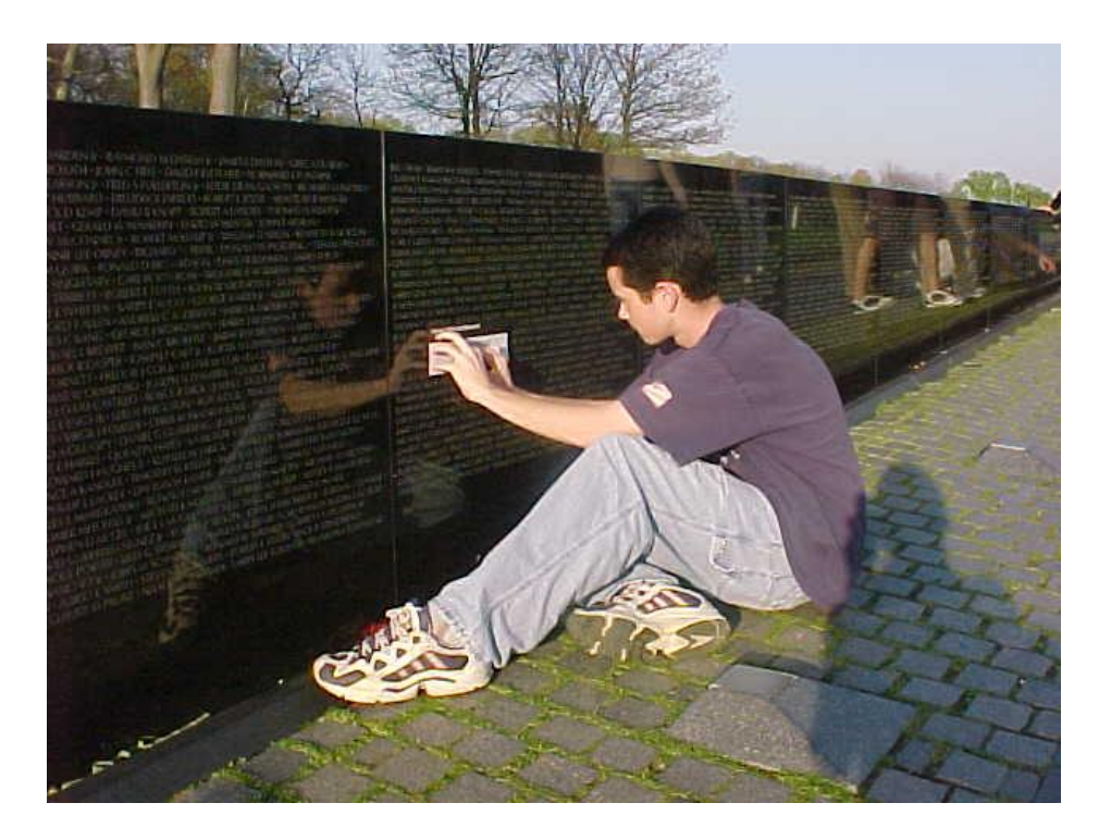
Figure 1. A LOV class student rubs a special name of a North Carolinian on The Wall .

"You learn that it was people my age who were killed, and you realize death is forever."