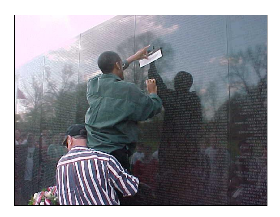
Figure 2. Helping a veteran-chaperone rub the name of a lost buddy.

"I got a deeper understanding of the reality. You can hear '58,000 people died' all day long, but it really makes an impact when you see it. It hits hard!"