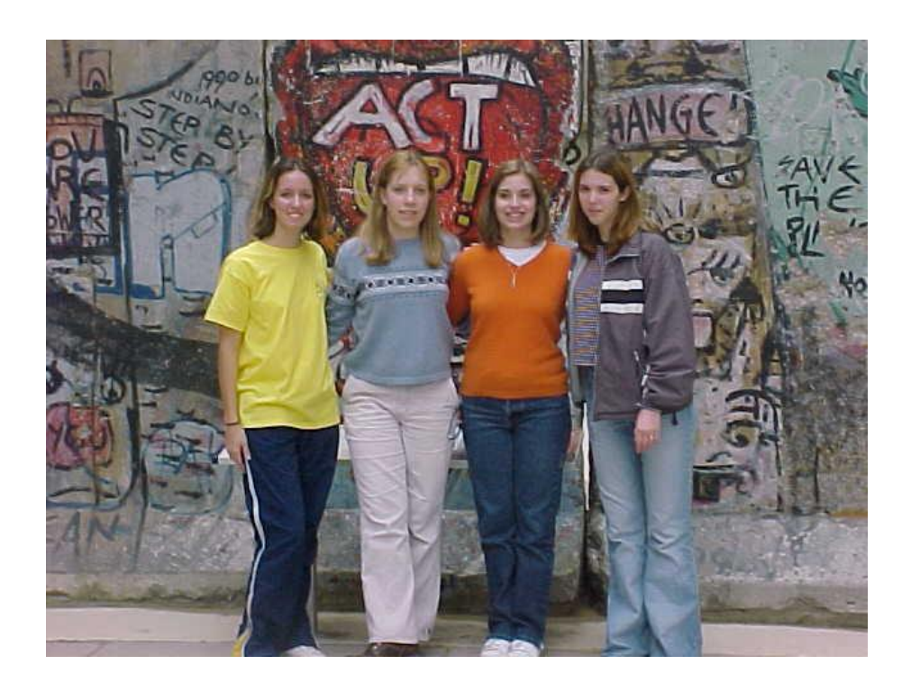
Figure 4. Classmates enjoy "free time" to visit the Newseum in Arlington, VA.

students have never been to our nation's capitol, and during this free afternoon they can visit historic sites and national museums of their choice (Figure 4).